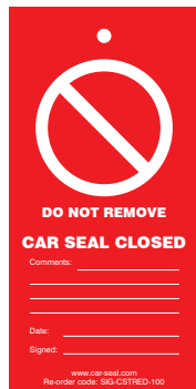
SIG-CST100RED Car Seal Closed Tag